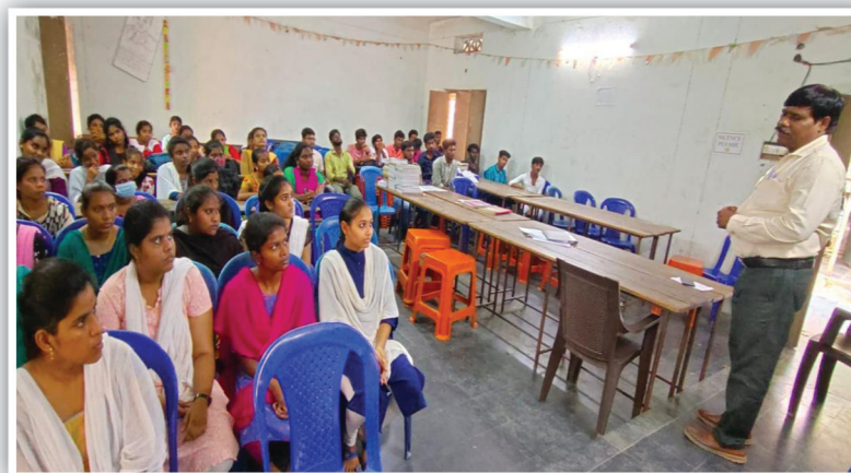
Audit team @ Student interaction

Our college had its first academic audit on 27 th August for the year 2020-21 by a two member team sent by CCE, AP. teaching and learning activity, leadership & Governance and college activities secured grade B to the college, though lack of basic infrastructure such as own building etc.