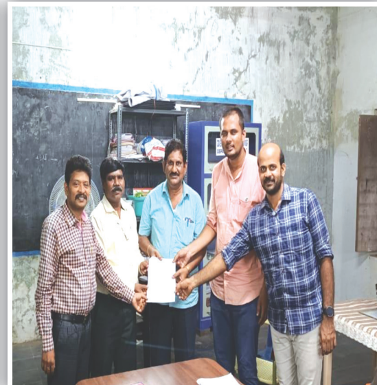
Presentation of Audit Results by the Audit Committee team Member