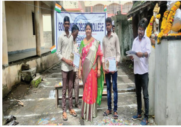
Distribution of Prizes to the Students