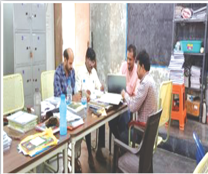
Audit Team Interacting with Academic cell and IQAC cell Co-Coordinator during Academic Audit